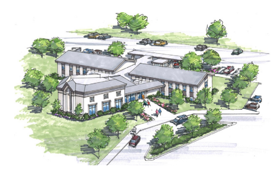
Aerial View from NE - North Campus

In our Masterplan is ministry space for our students and children that will be inviting and safe. The second gym will compliment those ministries. Our new fellowship/meeting space will provide more weekday opportunities. Added to that is worship space for our first service that is supported by classroom space for our on-campus life groups. Our continued growth requires the new parking to support our worship and ministries.